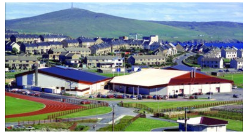
Clickimin Leisure Centre Shetland 1985