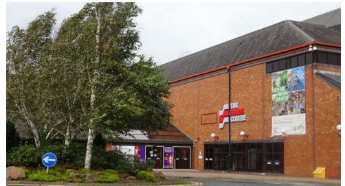
Carlisle Sands Centre 1980s