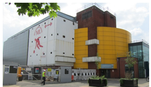
Moss Side Leisure Centre Refurbished 2018