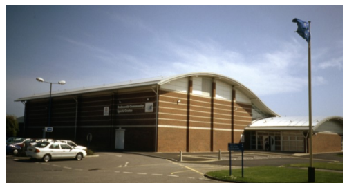
Budmouth Community Sports Centre 2003