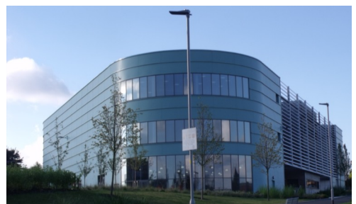
Bert Williams Leisure Centre, Bilston 2011