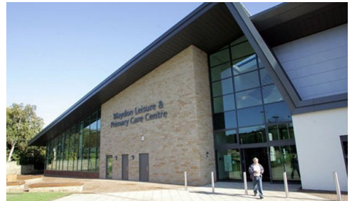
Blaydon Leisure Primary Care Centre 2010