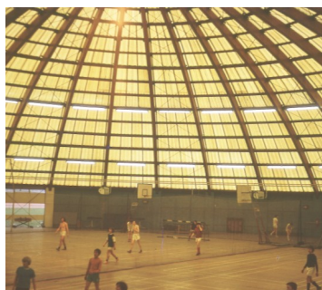
Lightfoot Centre 1971

SPACE & PLACE ARCHITECTURE FOR HUMAN BEINGS